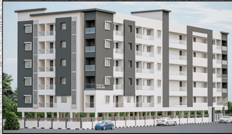
NAVANEETHA AYYAR PARK T.V.KOVIL, TRICHY.