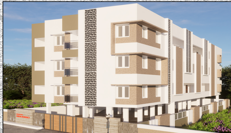
NAVARATHNA SAROJA RESIDENCY ANNAMALAI NAGAR, TRICHY.