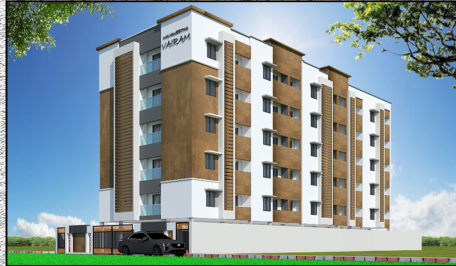
NAVANEETHA VAIRAM MARIS AVENUE, CANTONMENT, TRICHY.