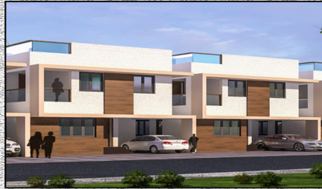
NAVANEETHA SRI RAM NIVASAM MUTHUNAGAR, SALAI ROAD, SRIRANGAM.