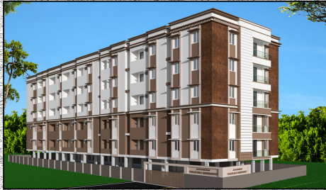
NAVANEETHA VINAYAGA RESIDENCY ANANDHA AVENUE, EB ROAD, TRICHY.