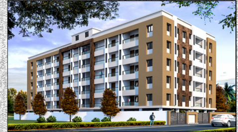
NAVANEETHA RR RAGHAVENDRA SALIVAN STREET, COIMBATORE.