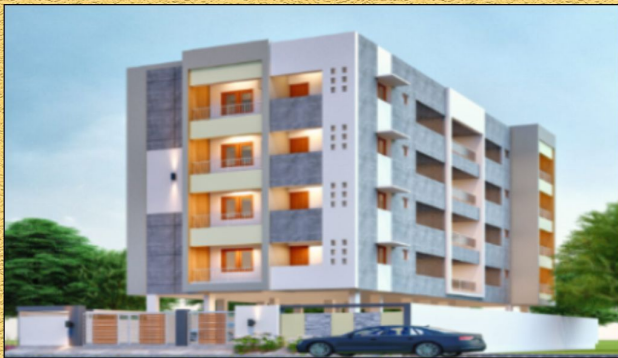
NAVANEETHA BLUE CLOUD RAMALINGANAGAR, TRICHY.