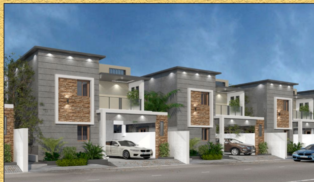
NAVANEETHA RAM NAGAR NATCHIKURICHI.