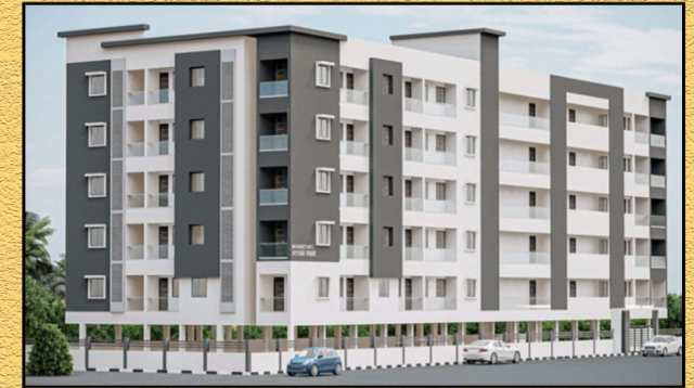
NAVANEETHA AYYAR PARK T.V.KOVIL, TRICHY.