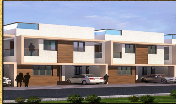
NAVANEETHA SRI RAM NIVASAM MUTHUNAGAR, SALAI ROAD, SRIRANGAM.