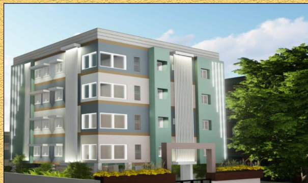
NAVARATHNA ORANGE RESIDENCY KK NAGAR, TRICHY.